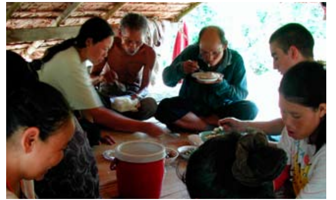
Students from Chico State and Chiang Mai University share a meal with local farmers in Northwest Thailand.

"It's great to be surrounded by Thai culture or any other non-American culture at that, because you realize there are other ways of living a fulfilling life."