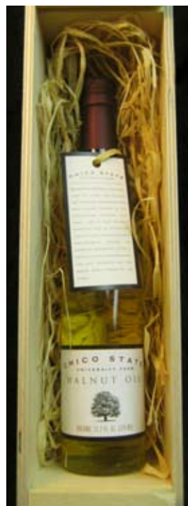
Chico State Walnut Oil

The College of Agriculture took a step into the gourmet cooking-oil market this year with the first press of Chico State Walnut Oil. The specialty oil is usually a product of France, but with the help of local walnut-oil maker Rick Cinquini, the college was able to produce a trial batch of the delicate, nutty oil using nuts grown on the Chico State farm.