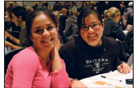
Students participating in the record breaking letter writing campaign for St. Jude's Children's Research Hospital at Up 'til Dawn