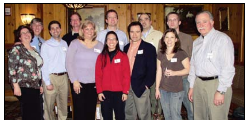
Alumni at the Boston Back Bay Hilton March 8, 2007

There has been a lot of discussion on campus about the importance of the "Chico Experience." The effect of this "experience"