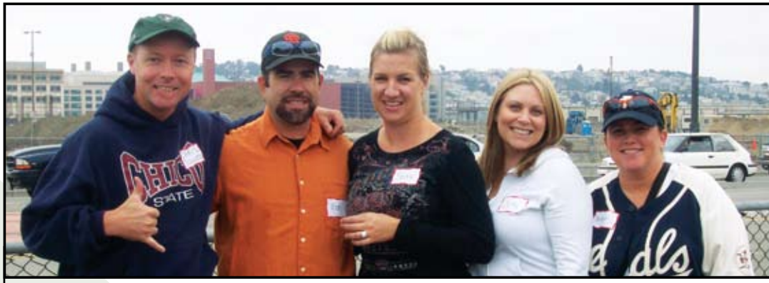
Alumni at the Annual Alumni Day at AT&T Park, September 9

In addition to the Summer Send-Off event held at Discovery Park in August (see p.1), the Sacramento Chapter also hosted the Annual Alumni Day at AT&T Park on Sunday, September 9, at the SF Giants v. LA Dodgers baseball game. The festivities started with a pre-game tailgate reception