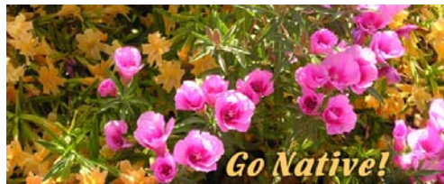
Clarkia and Monkeyflower.

More information about gardening with California's native plants may be found on the web site of the California Native Plant Society (CNPS) at www.cnps.org/cnps/horticulture/