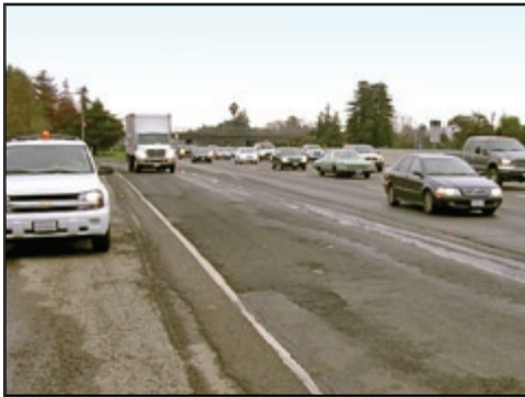
RAC-O-HB in the traveled ways and a conventional mix on the shoulder on SAC 99.