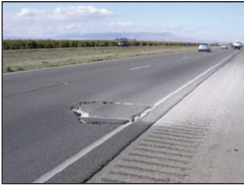
Reflective cracking from a slab on I-5.