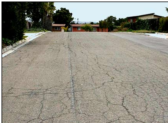
Figure 2. Pavement in poor condition (PCI = 40)