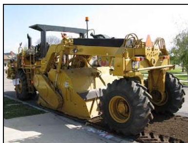
Figure 2. full-depth reclamation, Delano Calif.

bottom layer) and an open-graded mix (as the top layer). The first project consisted of recycling a polymer modified, open-graded HMA on SR 99 in Tehama County. It was determined that the HITONE process did not work well with these types of materials. The second project consisted of recycling a conventional dense-graded HMA on SR 62 in Riverside County near Palm Springs.