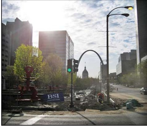
St. Louis welcomed pavement preservation practitioners from around the world.

In April 2009, almost 150 people from state and federal agencies, industry, consulting engineering firms and academia gathered in St. Louis, Missouri for two days of pavement preservation-related presentations. This conference was an exceptional