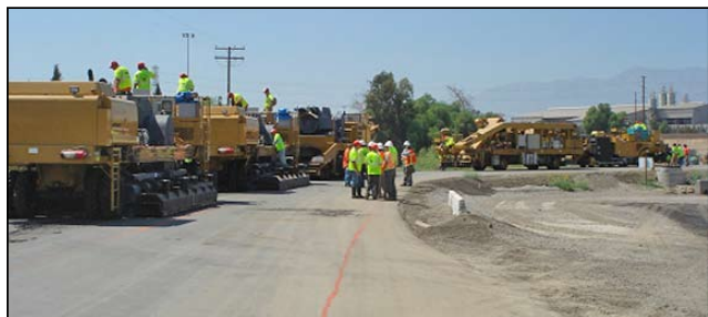
Figure 1. HITONE process being readied for work.

In the summer of 2008, Caltrans piloted two hot in-place recycling projects using a Japanese process called Hot In-place Transforming (HIT) known by the acronym HITONE