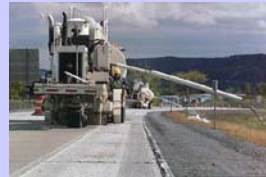
Grinding and texturing concrete