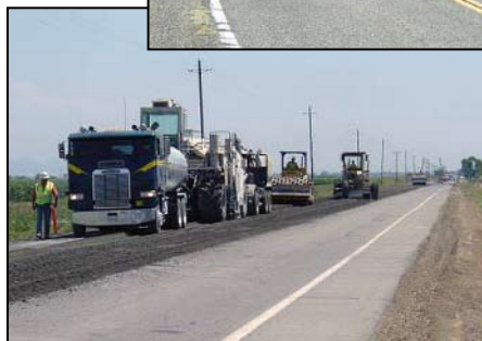
Figure 4. CIR process on SR 16.