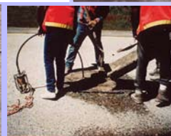
Dowel bar retrofitting