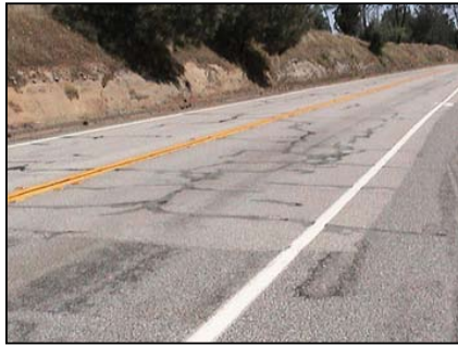
Slurry seal section.

treatments? Included here is a review of one SPS-3 project (06A3 GPS Section 061253, Butte – 32 PM 15.96 – 18.71, Average Annual ADT 2900) in California, where the sections were observed by the authors on February 12, 2009, after 19 years of service.