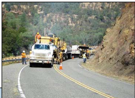
Figure 3. cold-foam equipment for full-depth reclamation.

In summary, because of limited financial and material resources, Caltrans will be using more in-place recycling than it has in the past. We continue to look at innovative ways to do "more with less" and thus reduce the carbon footprint of pavement preservation and rehabilitation processes.