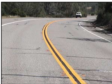
Thin, open-graded asphalt mix after 19 years.

These test sections provide proof of the viability of preventive maintenance treatments. It is our belief that by placing another PM treatment on these sections at this time the life of this roadway could be extended out another 5-10 years or more. When looking at the big picture, this site shows that an overlay placed in 1980 can be maintained for 30+ years in a condition that is acceptable to the general public and the taxpayers for the cost of a few PM treatments.