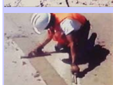
Partial depth repair