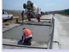
Full depth patching