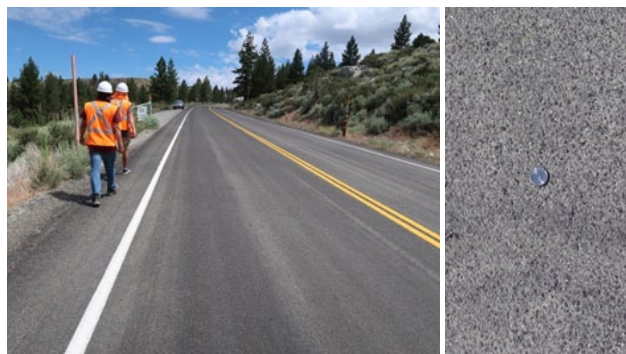
Figure 6. Example Photos of the Finished Scrub Seal Surface

Overall, the project went down relatively smoothly. The equipment appeared to be in good condition, and there weren't any major breakdowns. The PMRE scrub seal had a smooth appearance and did not exhibit "corn rowing" or "roping". The PMRE went down quickly, and no reflective cracking was observed directly after application. However, visible ridges showed through scrub seal from the crack sealant in the underlying pavement. The completed seal coat, with the 1/4 inch chips (Figure 6), was quieter to drive on, and was comparable to an HMA surface regarding noise level. The 1/4 inch scrub seal transformed the pavement surface from coarse and rough to a fine smooth finish with what appears to be more than adequate surface friction.