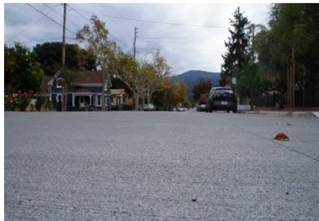
Figure 2. Broom-textured Concrete Pavement in Los Gatos

Considering the Future - As the project was being planned, Town officials wanted a picture of future maintenance costs, and requested