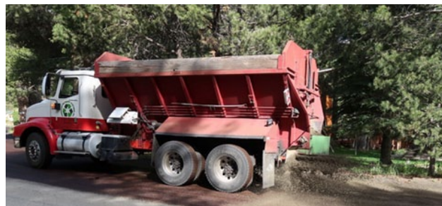
Figure 5. Sand Truck Spreading Sand over Flush Coat