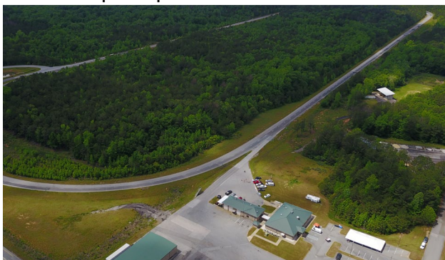
Figure 1. NCAT Test Track

The National Center for Asphalt Technology (NCAT) Test Track has been a successful pavement proving ground for the past 15 years. The 1.7-mile oval Test Track is a unique accelerated pavement testing facility that brings together full-scale pavement construction with high-speed, heavy trafficking for detailed analysis of realistic asphalt pavements.