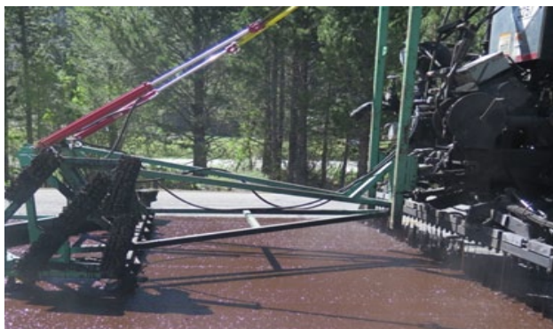
Figure 3. Distributor Truck with Brooms Applying the PMRE

Figure 3 illustrates a distribution truck applying PMRE on the existing pavement with a scrub broom; Figure 4 is a computerized Bearcat chip-spreader applying 1/4 inch screenings; while Figure 5 shows a truck spreading sand over the final flush coat.