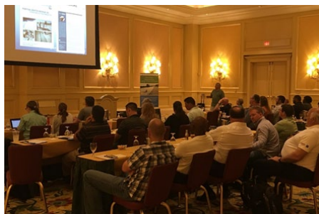
Figure 1. Participants at FHWA Peer Exchanges

Participants from 21 State agencies and Federal Lands Highway shared their experiences and