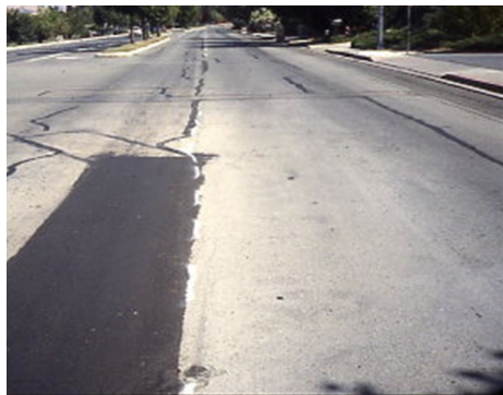
Figure 1. Preliminary Crack Sealing and Patching

patch will be more “open” (porous) compared to the surrounding old pavement that has been under traffic for years, so an important final step is to apply a fog seal of asphalt emulsion to the surface of the new patch. This will help seal the surface so it won’t absorb the binder in the future surface treatment.