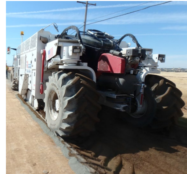
FDR Machine in Action

strength and tackle the base failure that plagues most deteriorated roadways. This process is a 'bottom-up' approach to roadway rehabilitation without the cost, hassle, and waste of traditional removal and replacement.