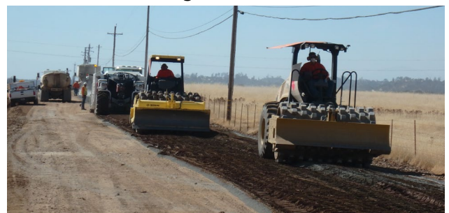
Initial Rolling of Pulverized Material

After the FDR pulverization and mixing, two sheepsfoot rollers were used to initially compact the loose material. A Cat 140M motorgrader outfitted with automated cross slope grade control was used to establish final grade. Then final rolling was done with a vibratory steel smooth drum roller. Caltrans Standard Specification Section 30-4 "Full Depth Reclamation-Cement" was used as a guide for developing the Mix Design and performing QA/QC. CGI Technical Services Inc. from Redding, CA provided all of the materials testing, including daily moisture monitoring as well as field NDT compaction testing. Four (4) 4000 gallon water trucks were utilized to shuttle water to the remote project area for both the FDR-C process and moisture curing.