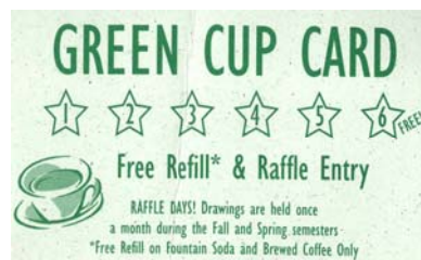
The Green Cup Card

The highly successful Green Cup Card program began during the intersession of 2006 and since then has been widely accepted by faculty, staff and students. Interestingly enough, then majority of the Green Cup Card users are full time faculty and staff. This means that the reduction in energy use and waste will continue for years to come as habits change and people become accustomed to using reusable cups. A special thanks to the A.S. Food Services for their enthusiastic cooperation and support for the continuation of this project.