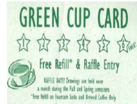
The Green Cup Card

Remember, reusable containers can also be found at the A.S. bookstore, such as Klean Kanteen and Nalgene bottles.