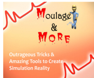
Moulage & More