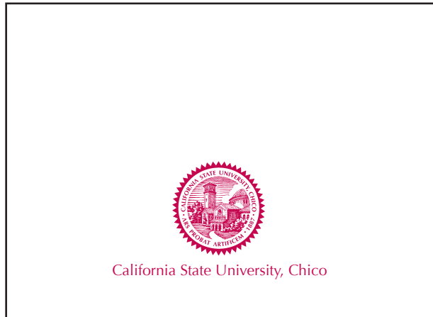
Graduation Announcement, Front