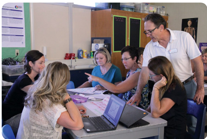
CUSD teachers and SOE teacher candidates participate in the fall 2016 triad workshop series

To access or download units from previous Triads, please visit the Triad website at http://mysoe.net/triad/ . For more information, current events, and highlighted units, please like the Triad Facebook page at www.facebook.com/triadpd/ .