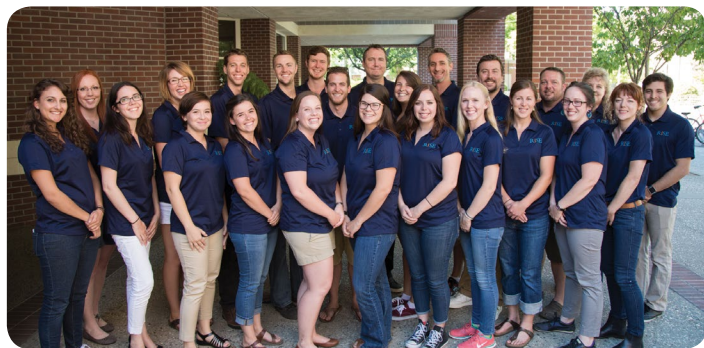
RiSE Cohort 2016