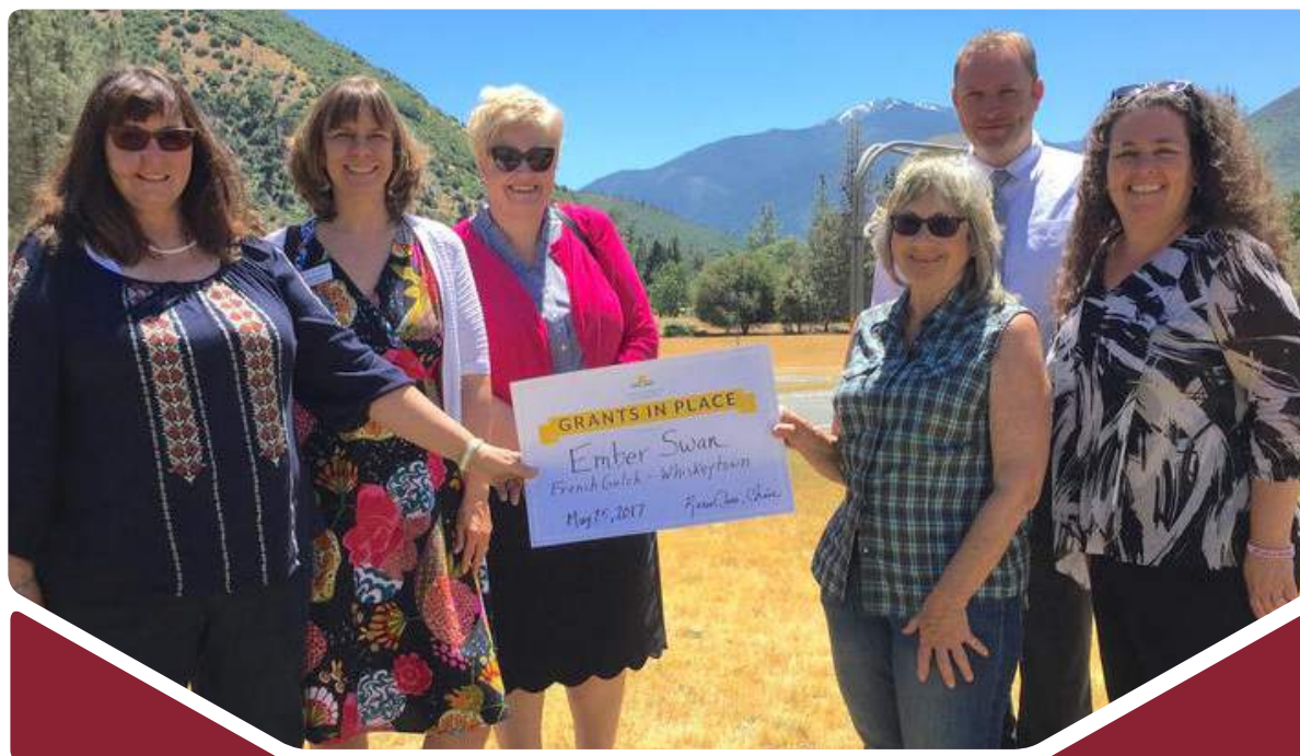
North State Together pg. 11