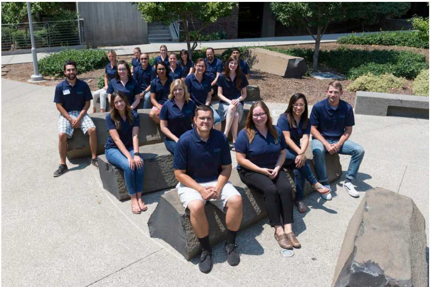
RiSE Cohort 3 Residents, 2017-18

RiSE is currently in their fourth year of the grant, and we are moving along stronger than ever. Throughout the years, we've built long-lasting collaborations with our partner districts, content supervisors, and mentor teachers. RiSE is now an acknowledged, successful program and by the time the grant is complete, we will have produced over 70 high-quality future teachers, all in high-need subject areas. We are very happy with our work, and we appreciate everyone who has been a part of it. We want to congratulate our Cohort 3 RiSE graduates, who will be successfully completing the program in June 2018, and we are also very eager to meet our Cohort 4 residents!