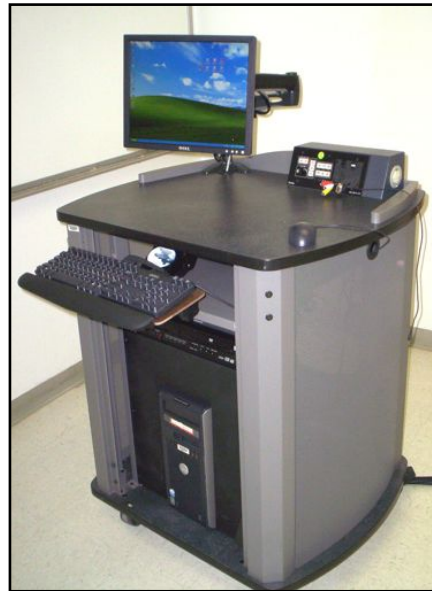
New workstation in Tebama 119

The older Dell GX 240's computers in 15 classrooms have been replaced with new Dell GX 520's.