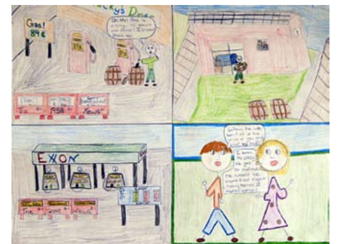
「無題 (ガソリン代高騰)」 ジョエル ワトソン ●マリーゴールド小学校6年●カリフォルニア州チコ市●米国

This artwork shows one example of how rising tide water due to global warming will affect people near the coastlines of the world. (By Susan Pool)