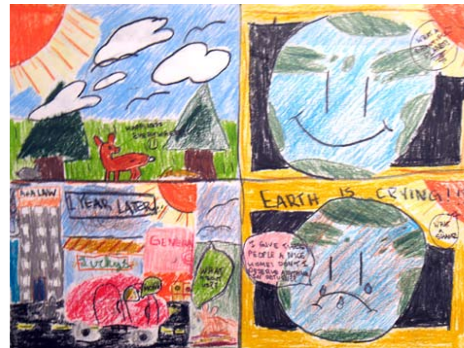
「地球に笑顔を」 ラレッタ ジョンソン ●マリーゴールド小学校6年 ●カリフォルニア州チコ市●米国

Furthermore, it is impressive how children look at the world more deeply and profoundly than we may expect.