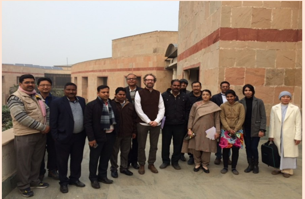
[Gautam Buddha University]