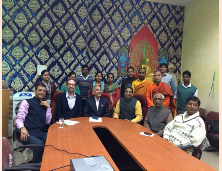
[Benares Hindu University]

In January 2016, I was invited to deliver a series of lectures in India about my current research on Buddhism and communication. The book I am working on is divided into two parts. The first part examines the effects of changing communication environments in India during the time of the Buddha, and the second part looks at how modern digital communication has affected the growth and intellectual development of Buddhism. I gave a talk at Benares Hindu University and at Gautama Buddha University about Buddhism in ancient India, and a talk at the Center for the Study of Developing Societies in Delhi about Buddhism and conceptions of selfhood in cyberspace. I was very happy to see that the talks were well attended and both faculty and students at the institutions where I spoke were very engaged as well as welcoming and helpful during my stay. I received a lot of useful comments from the surprising amount of scholars there who were researching topics that were quite relevant to my own course of study. A number of scholars and students came up to me after the talks to request more information about CSU Chico, and I proudly told them about our programs here.