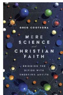
Mere Science and Christian Faith