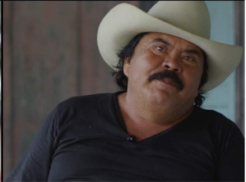
"UNCLE B" ILLEGAL MINER

"The ones who started the war all killed each other. It was then that we could speak to the people of peace."