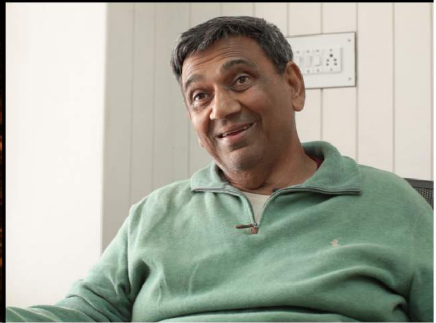
BIG GARIMPEIRO EMERALD MINER

"Look at what diamonds have done to the business in Africa. Today they are tainted red. But I don't think emeralds come in any color except green."