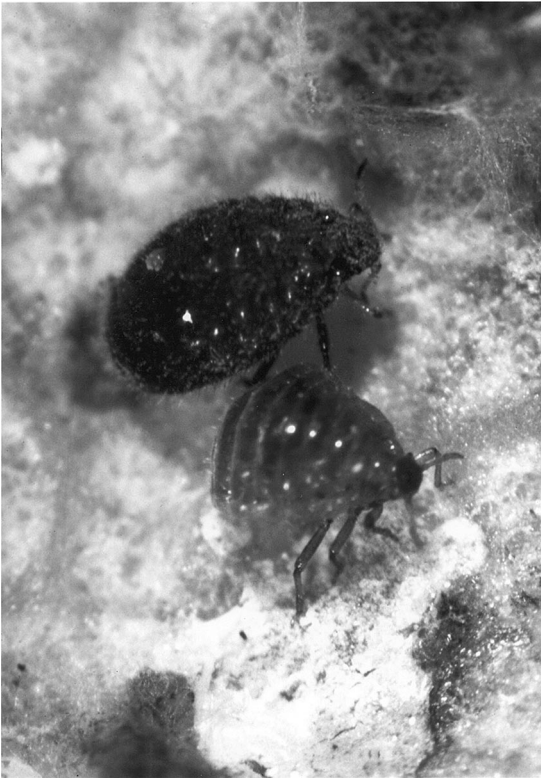
Fig. 1. Inquiline aphid, T. inquilina (top), co-occupying a gall on A. viscida with its host, T. coweni (bottom). T. inquilina is markedly more pubescent and sclerotized than T. coweni . Both specimens \approx 1 mm in length.

arena in which behavioral interactions among gall inhabitants can occur relatively freely; furthermore, these galls may house numerous individuals representing overlapping generations (Rohfritsch and Shorthouse 1982, Forrest 1987, Crespi and Worobey 1998). In some aphid species, females invade galls intra- or interspecifically, expelling or even killing the occupant in the process (Aoki and Makino 1982, Akimoto 1989, Akimoto and Yamaguchi 1997, Inbar 1998). In contrast, foundresses of the manzanita leaf-gall aphid, Tamalia coweni (Cockerell), can establish galls solitarily or with other females. Thus, T. coweni behaves as a facultatively communal species (Miller 1998a). A recently described species, Tamalia inquilina Miller, specializes in entering occupied or abandoned galls of T. coweni (Miller and Sharkey 2000) (Fig. 1).