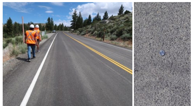
Figure 6. Example Photos of the Finished Scrub Seal Surface

Overall, the project went down relatively smoothly. The equipment appeared to be in good condition, and there weren't any major breakdowns. The PMRE scrub seal had a smooth appearance and did not exhibit "corn rowing" or "roping". The PMRE went down quickly, and no reflective cracking was observed directly after application. However, visible ridges showed through scrub seal from the crack sealant in the underlying pavement. The completed seal coat, with the 1/4 inch chips (Figure 6), was quieter to drive on, and was comparable to an HMA surface regarding noise level. The 1/4 inch scrub seal transformed the pavement surface from coarse and rough to a fine smooth finish with what appears to be more than adequate surface friction.