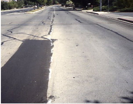
Figure 1. Preliminary Crack Sealing and Patching

patch will be more “open” (porous) compared to the surrounding old pavement that has been under traffic for years, so an important final step is to apply a fog seal of asphalt emulsion to the surface of the new patch. This will help seal the surface so it won’t absorb the binder in the future surface treatment.