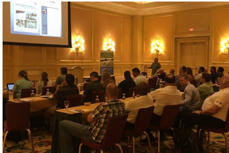
Figure 1. Participants at FHWA Peer Exchanges

Participants from 21 State agencies and Federal Lands Highway shared their experiences and