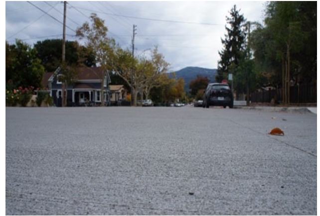
Figure 2. Broom-textured Concrete Pavement in Los Gatos

Considering the Future - As the project was being planned, Town officials wanted a picture of future maintenance costs, and requested