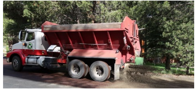
Figure 5. Sand Truck Spreading Sand over Flush Coat