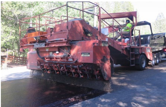
Figure 4. 1/4 inch Chips Being Spread by BearCat Computerized Spreader