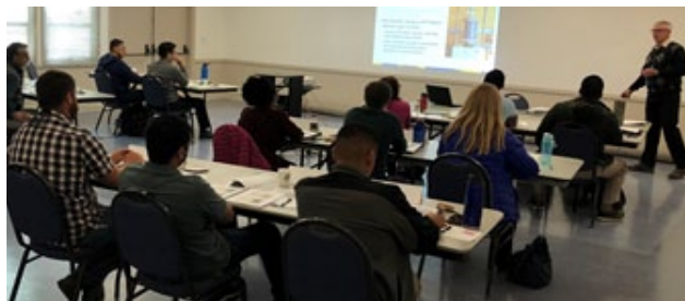
Figure 1. CCPIC Training Session hosted by City of Orinda

CCPIC wants to make sure you get the training you need to utilize the most advanced, cost-effective, and sustainable pavement practices possible to better repair and maintain California's roadways. Some popular