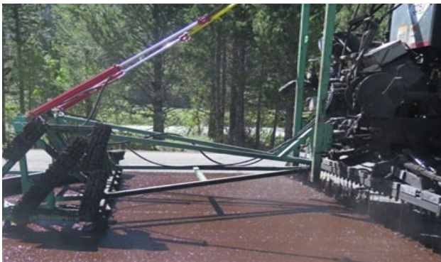
Figure 3. Distributor Truck with Brooms Applying the PMRE

Figure 3 illustrates a distribution truck applying PMRE on the existing pavement with a scrub broom; Figure 4 is a computerized Bearcat chip-spreader applying 1/4 inch screenings; while Figure 5 shows a truck spreading sand over the final flush coat.