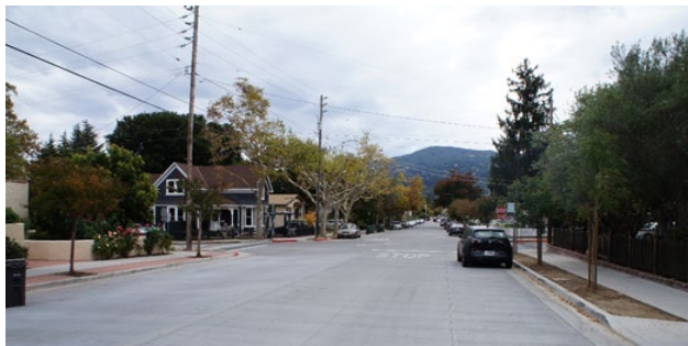
Figure 1. New Concrete Street in Los Gatos

In the 1930's, 10 concrete pavement roads were built in Los Gatos, and now history is being made a second time. After more than 85 years of service, the roads were reconstructed with concrete pavement to capture the life-cycle