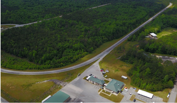
Figure 1. NCAT Test Track

The National Center for Asphalt Technology (NCAT) Test Track has been a successful pavement proving ground for the past 15 years. The 1.7-mile oval Test Track is a unique accelerated pavement testing facility that brings together full-scale pavement construction with high-speed, heavy trafficking for detailed analysis of realistic asphalt pavements.