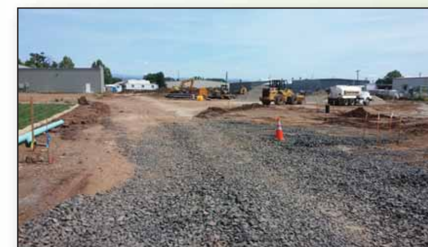
C: Thought to be vacant, now under development