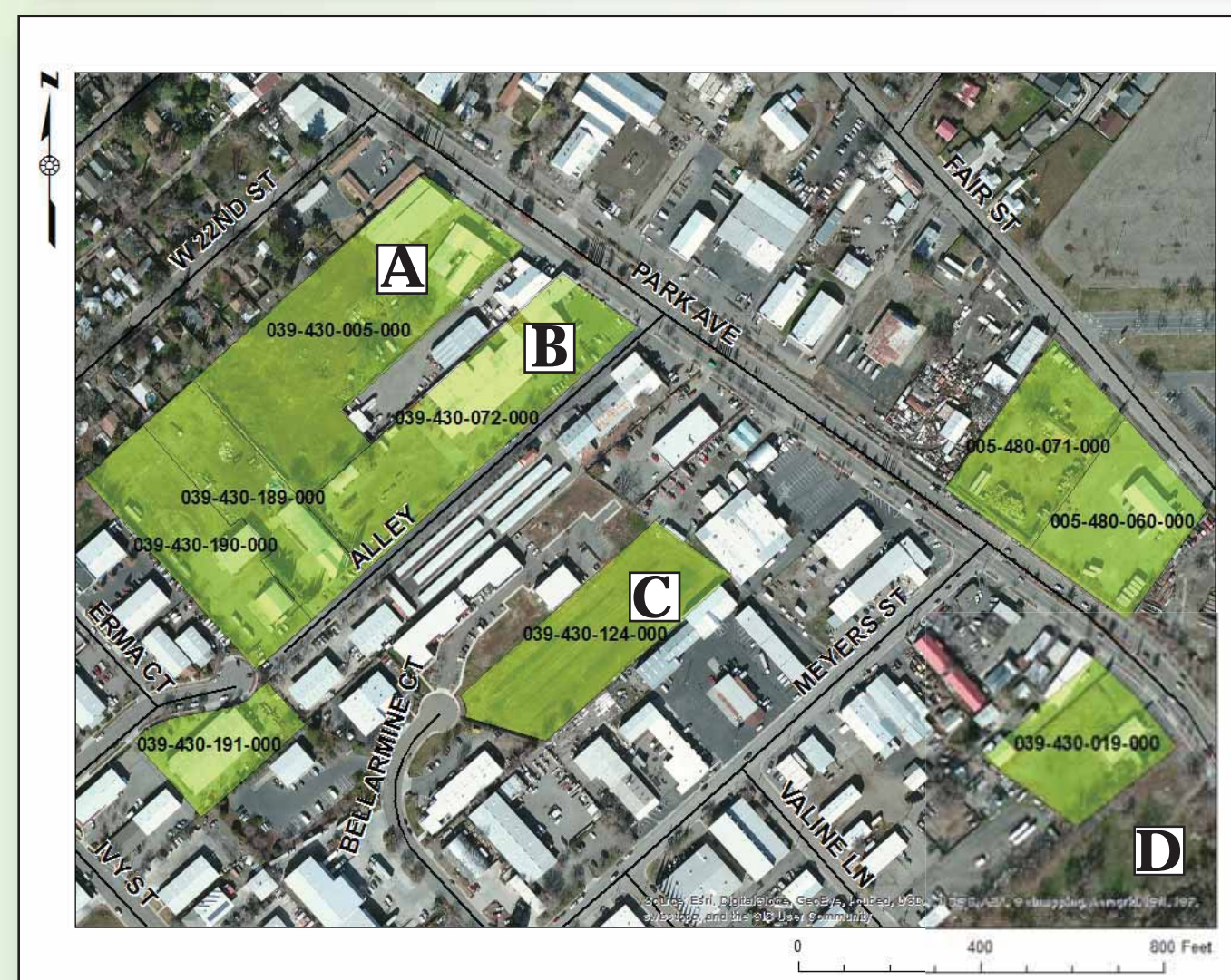
Green polygons show the 9 qualifying parcels; pictures to right are ground images of a few lots