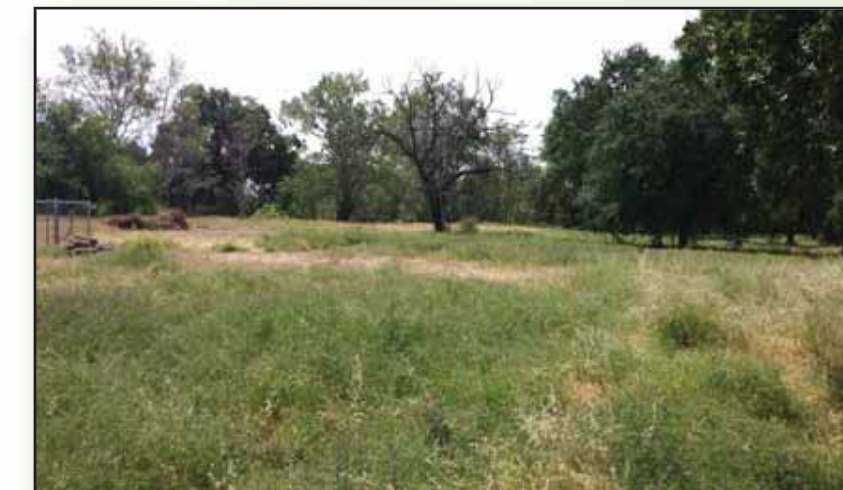
D: Optimal vacant lot, eliminated from analysis by old data