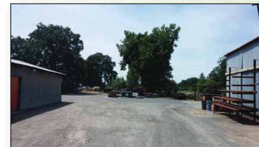
A: Partially occupied by part-time antique store