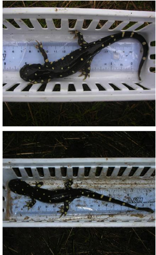
FIGURE 2. Two photographs representing an initial capture and recapture of the same adult salamander. Similar photographs were taken of every adult and juvenile salamander captured in the drift fence array in order to identify them based on the spot pattern found on their dorsal surface.

All digital photographs were entered into a pattern recognition program that was custom-designed for our use with California tiger salamanders (Conservation Research, Ltd.). For each photograph, the program extracted information on spot positions, and used this information to rank all other photographs previously entered into the database based on their probability of representing the same individual using two different algorithms. A