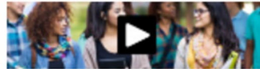
Understanding Components of your Award Letter