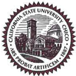
California State University, Chico

Therefore, Be It Resolved by the signatures of the representatives on the dates indicated below that California State University, Chico and the Mechoopda Indian Tribe of Chico Rancheria do formally endorse and accept this Memorandum of Agreement and agree to review the MOU every five years from the date signed.