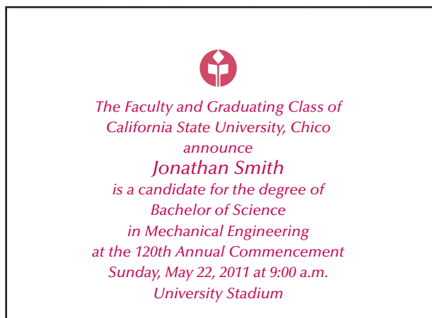
Graduation Announcement, Inside