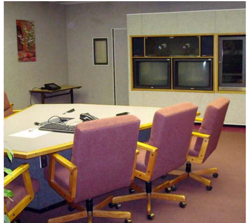
CSU Chico TLP