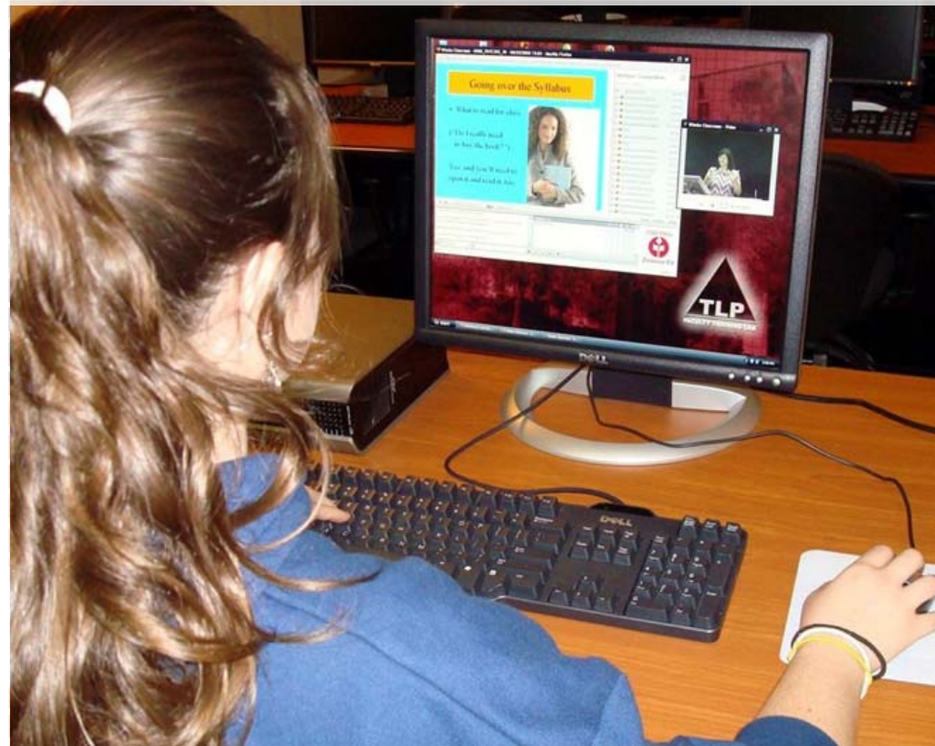
CSU Chico TLP