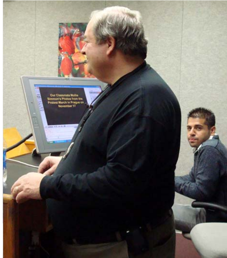
CSU Chico TLP