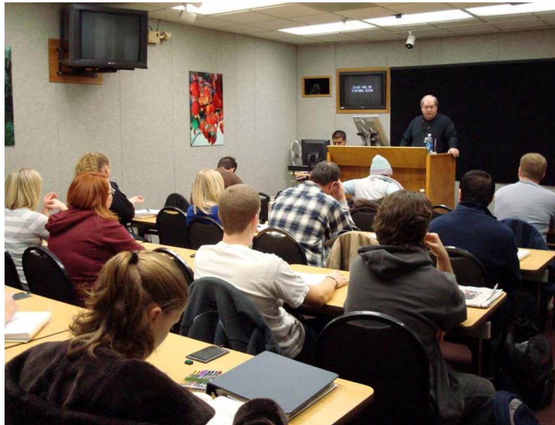
CSU Chico TLP